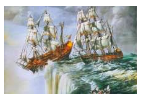
Is the world 'flat' ...

Department of Sociology and Social Work University of Wisconsin-Stevens Point